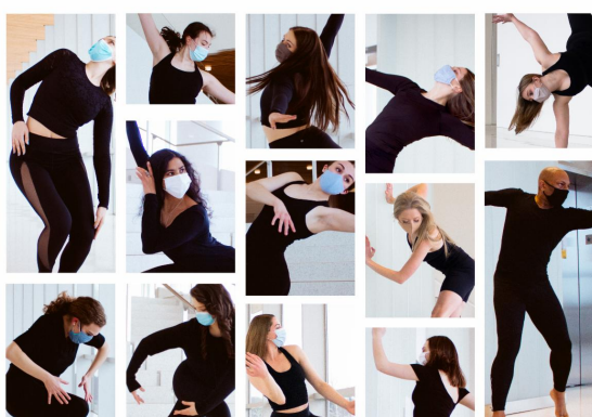
The UI Dance Company