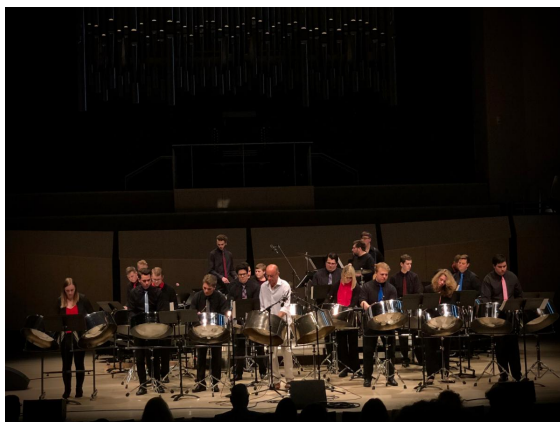
Iowa Percussion Ensemble